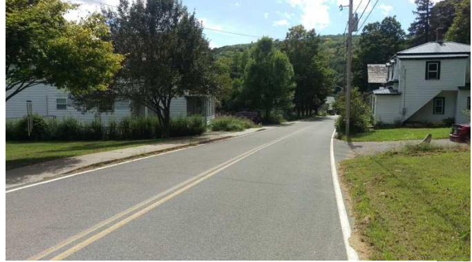
Figure 3. North Street facing north between Route 2 and Church Street in Erving

There are two distinct segments of North Street in Erving, a northern segment and a southern segment. From Route 2 north to the intersection with Church Street (approximately 0.2 miles), the southern segment of the road is zoned as central village/village residential and is populated by closely spaced homes. There is a small grocery market on the southeast corner at Route 2, and a restaurant across the street on the southwest corner. This segment of North Street is approximately 24 ft wide with a double yellow center line, white edge lines, and a concrete sidewalk adjacent to the east side of the roadway. The pavement is in fair condition, with some minor cracks.