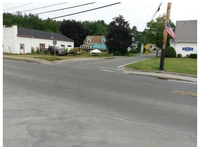
Figure 2. Church Street, facing north at its intersection with Route 2 in Erving

Church Street is zoned as central village/village residential in the town of Erving and is populated by closely spaced homes. The Erving Fire Department is located at the southeast corner at the intersection with Route 2 and there is a small park and playground adjacent to the Fire Department on Church Street. The speed limit is 25 mph in both directions and there is a slight uphill grade traveling to the north. Church Street is STOP controlled at its intersection with Route 2, and also at its intersection with North Street.