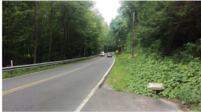
Figure 4. Gulf Road, Northfield

Gulf Road is in a residential/agricultural/forested zoning area in the town of Northfield. Houses along the roadway are thinly spaced and most roadside land is forested. There are steep uphill and downhill slopes at various points along Gulf Road, with guardrail protecting the downhill slopes away from the roadway. There are multiple horizontal curves as well as steep vertical grades over the length of the road. The steepest grade is 11%, north of Prospect Hill Road. There is a grade warning sign at the crest of a vertical curve near Orange Road, where the vertical grade is approximately 6%, as well as a horizontal curve. There are also signs warning “caution icy road”. The posted speed limit is 35 mph. There are no traffic controls at either end of Gulf Road within the study area.